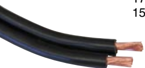
6 ga. Dual Conductor Wire