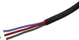
14 ga. 3-Conductor Wire

Please call for sugg. fleet price on replacement part pricing. All prices subject to change without notice.